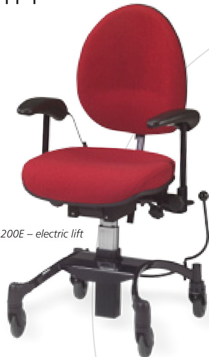
VELA Tango 200E – electric lift

Both models can also be supplied with coxit seats.