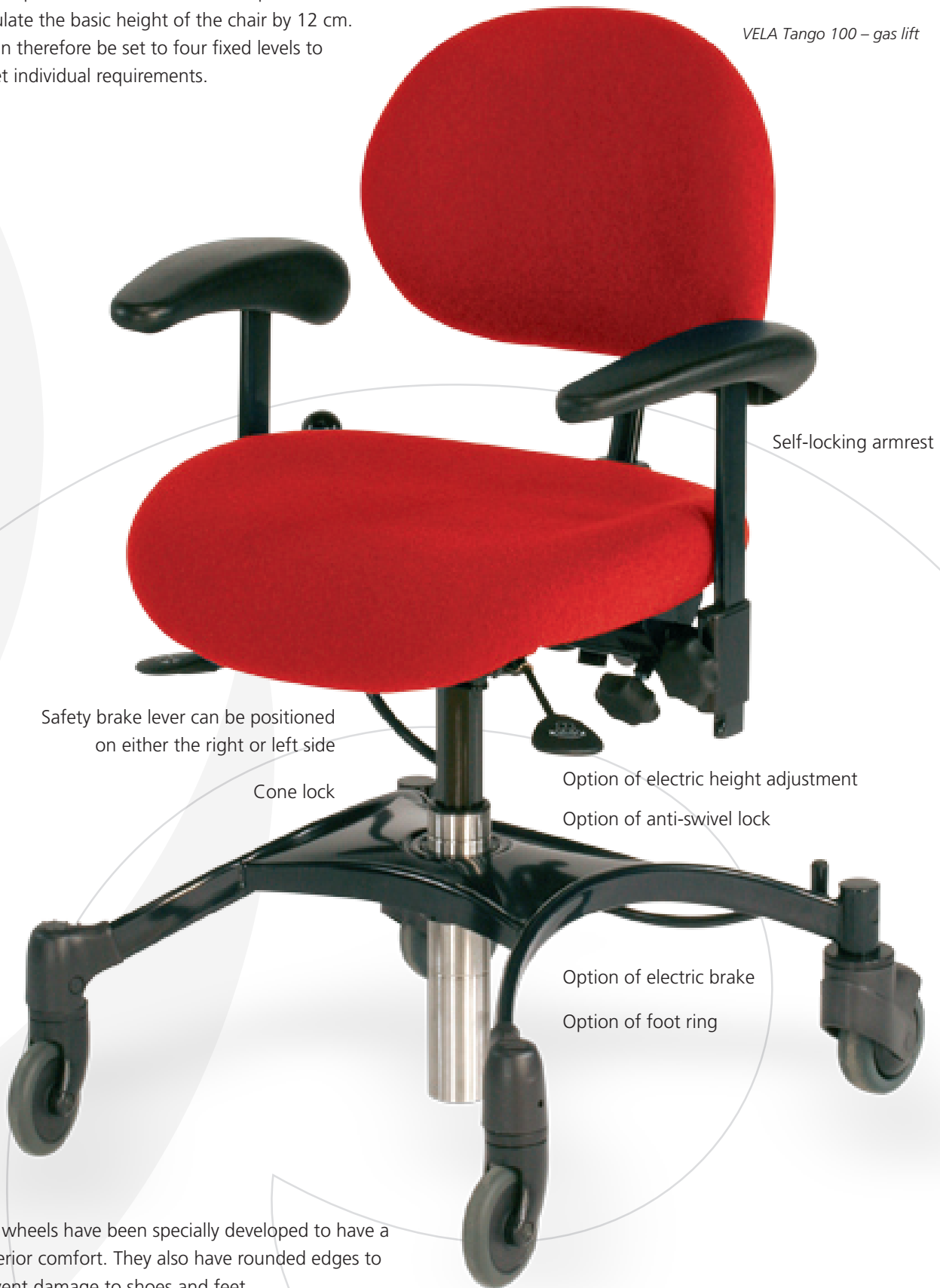
VELA Tango 100 – gas lift

VELA's patented cone lock makes it possible to regulate the basic height of the chair by 12 cm. It can therefore be set to four fixed levels to meet individual requirements.