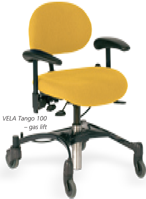
VELA Tango 100 - gas lift

As people are individuals and have different needs, it is completely natural that VELA supplies products that meet the unique wishes and requirements of individual users.