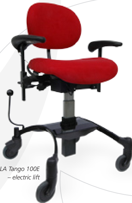
VELA Tango 100E – electric lift