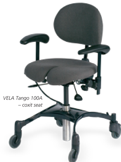
VELA Tango 100A - coxix seat

Both models can also be supplied with coxix seats. The chair is particularly suitable for users who need to sit with one or both of their legs at an open angle relative to their body. The two levers can be used independently of each other in stepless increments.