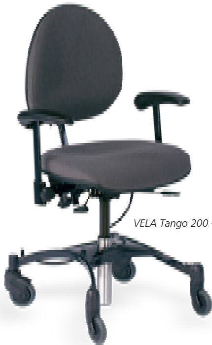
VELA Tango 200 – gas lift

VELA Tango 200 is specially designed for people who require extra support and comfort.